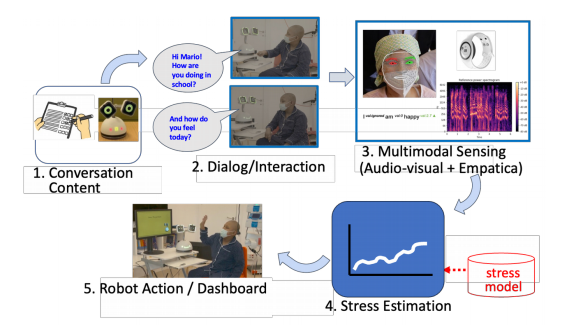
Fig. 1: Overall block diagram of the proposed system

support and enhancing the children hospital experience [5].